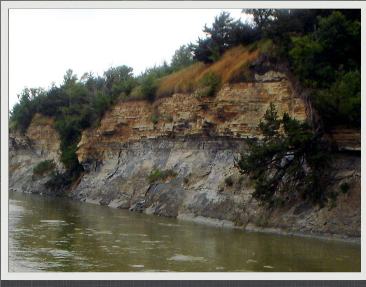
Niobrara State Park